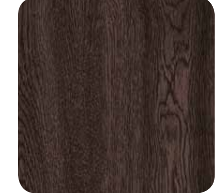
Dark Oak – D 8116 MR