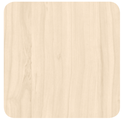
Nordic White – D 1115 MR