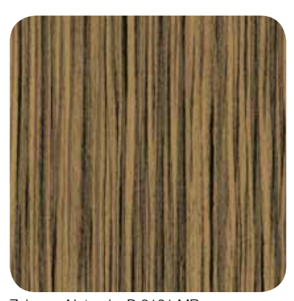
Zebrano Natural – D 8121 MR