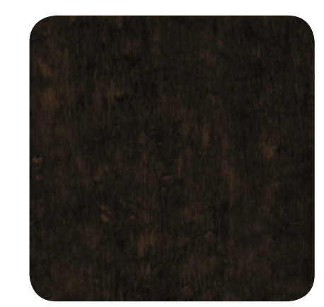
Café Brown – D 8120 MR