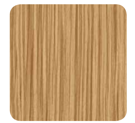
Koya Line – D 1119 MR