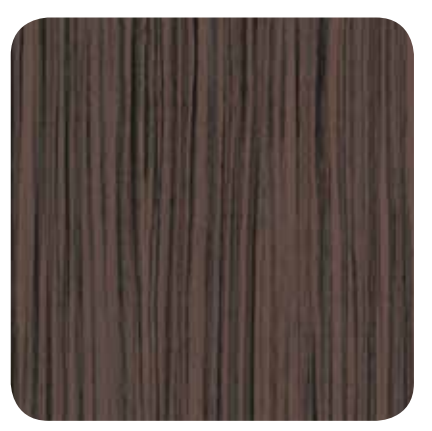
Dark Zebrano – D 8123 MR