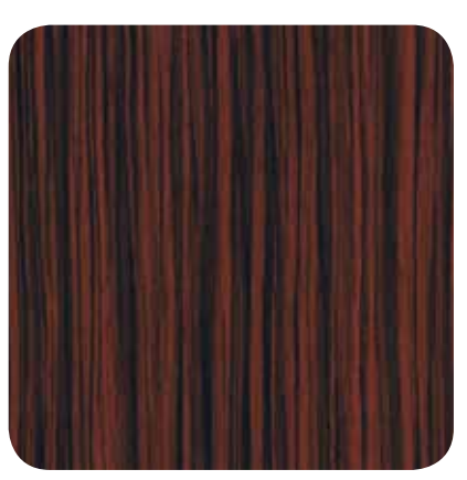
Okene Line – D 8122 MR