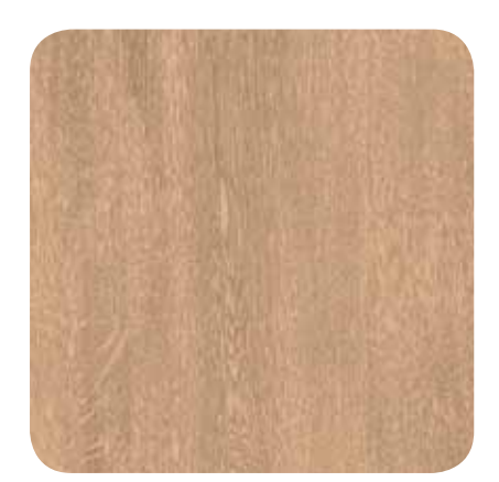
Pale Oak – D 1121 MR